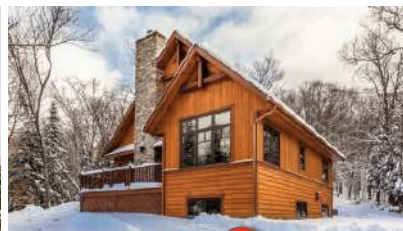
Le Mont Blanc

Selling price : 685 000 $ Annual income : 92 000 $