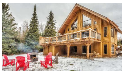
Le Mont-Tremblant 1

Selling price : 805 000 $ Annual income : 100 000 $