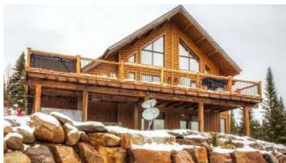
Le Mont-Tremblant 2

Selling price : 355 000 $ Annual income : 42 000 $