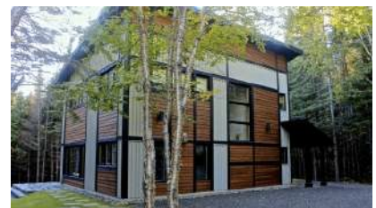
Le Plein Nord

Selling price : 660 000 $ Annual income : 85 000 $